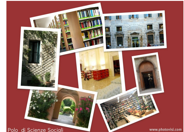
Polo di Scienze Sociali